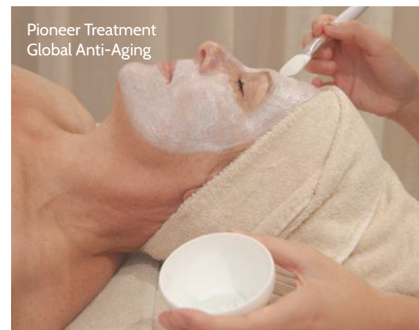
Pioneer Treatment Global Anti-Aging

This treatment oxygenates and illuminates the skin. Combined with marine skincare and expert massage techniques, the complexion regains an instant boost of radiance within just a few minutes.